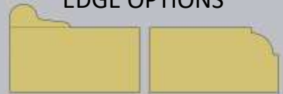
Ogee Applique Option